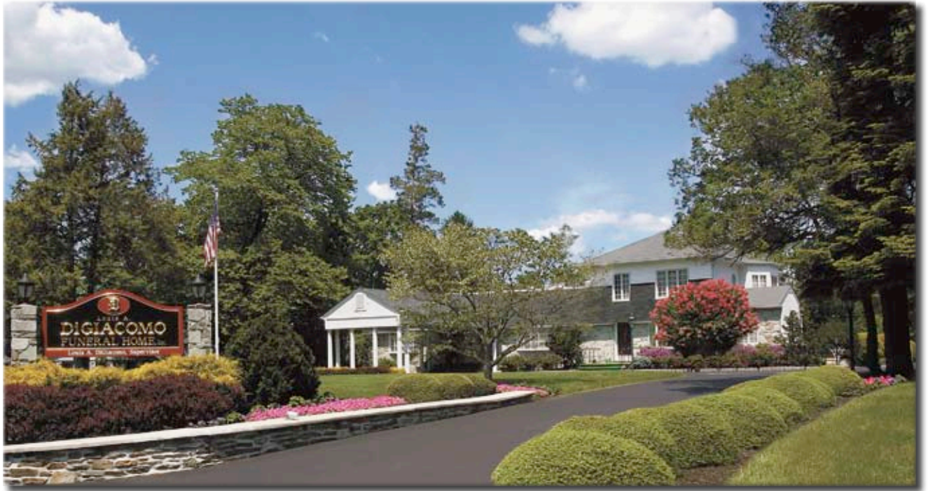
Louis A. DiGiacomo Funeral Home